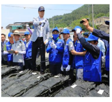
Related Website (if any, please add) https://www.wando.go.kr/chiu4u