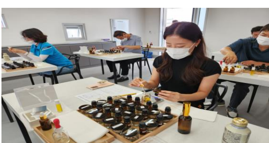
CHPS the Five Sences in Operating Performance Survey

O Cheongsan Marine Healing Park Operating Performance