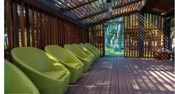
Cheongsan Marine Healing Center