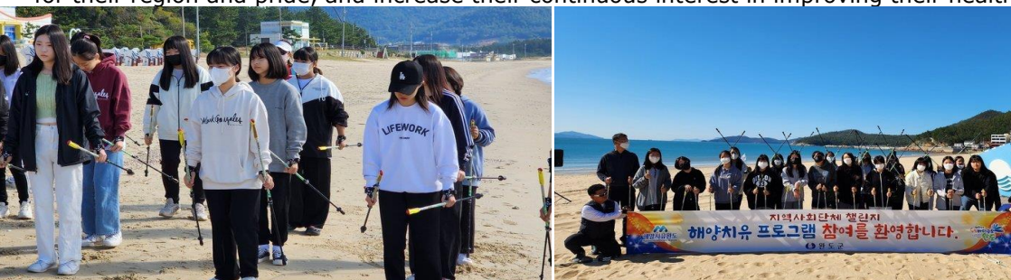
Marin Healing Experience Programs for Local Youth

- Provided marine healing experience programs for local youth (middle and high school students), providing an opportunity to properly understand local resources, inspire affection for their region and pride, and increase their continuous interest in improving their health.