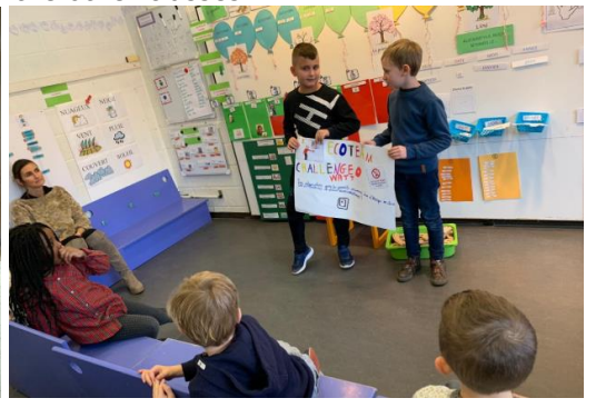
Explaining and promote the solutions