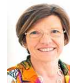
Gerda Stuchlik Green capital in Germany Mayor of Freiburg GERMANY