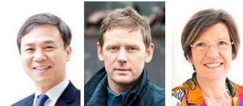
Seung-Su Kim Mayor of Jeonju opening speech